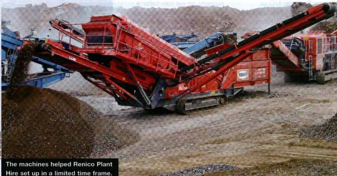
The machines helped Renico Plant Hire set up in a limited time frame.

After winning a bid for the crushing and screening of six borrow pits alongside one of South Africa's national roads, Renico Plant Hire took delivery of a Terex Finlay J-1175 jaw crusher and a Terex Finlay 683 Supertrak from Pilot Crushtec in a deal worth R5,9-million. The machines are able to produce between 210 tph and 250 tph of a -40 product in a very tight time frame. A complete crushing-and-screening plant can, typically, be set up and operate at full capacity